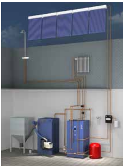
Figure 3. An example of a pellet boiler with a solar heating system. This system can easily provide space heating and hot water all year round. Illustration: Baxi

Wood chip-fuelled boilers may be used to provide heat in larger houses, for farm buildings, or for industrial furnaces. Automatic operation and lower emissions because of continuous combustion are the advantages of wood chips heating systems compared with firewood boilers. Wood chip-fuelled boiler capacity ranges from between 15 kW to 100 MW [10].